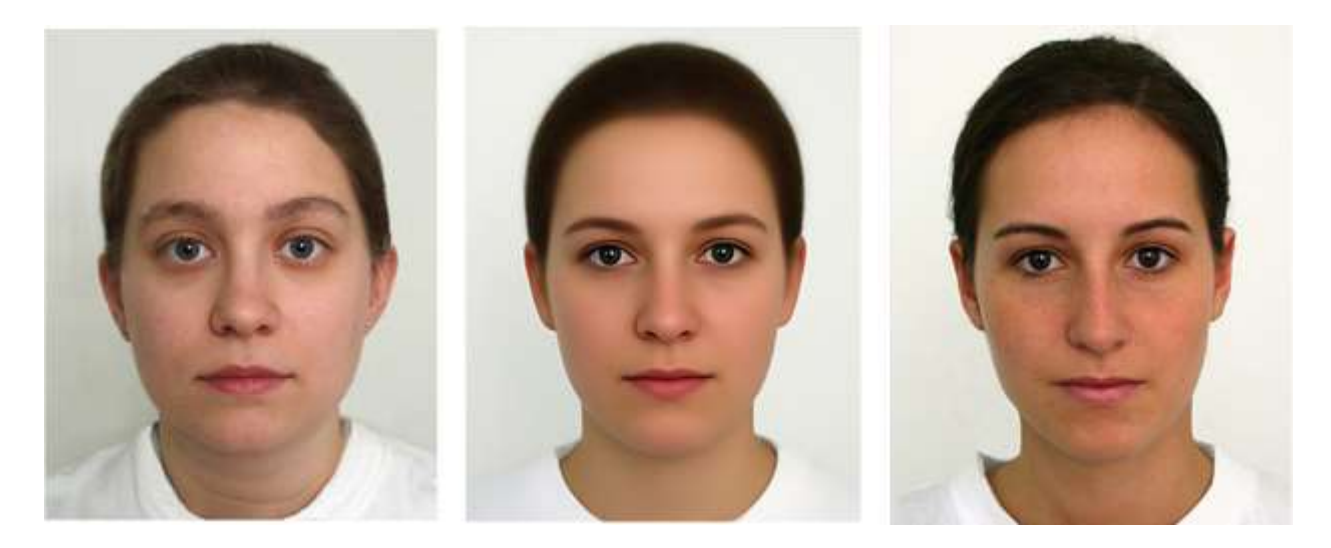
Figure 1 . Above are examples of low attractive (left), average (center), and high attractive (right) female faces.